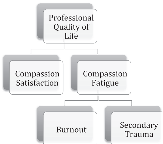
Figure 2 Professional Quality of Life Model (Stamm, 2013)

VT is described as something that is related to STS in that both are about being exposed to the trauma material of others, the difference being that VT is provoked by repeated exposure over time. Contrary to Figley, she now sees CF as a descriptive term addressing the quality of a person's experience. Pathology may also be present, but it would be comorbid to CF. Examples such as burnout accompanied by depression or CF accompanied with PTSD are offered.